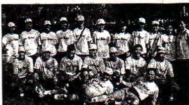
VGAC tại Bình Châu