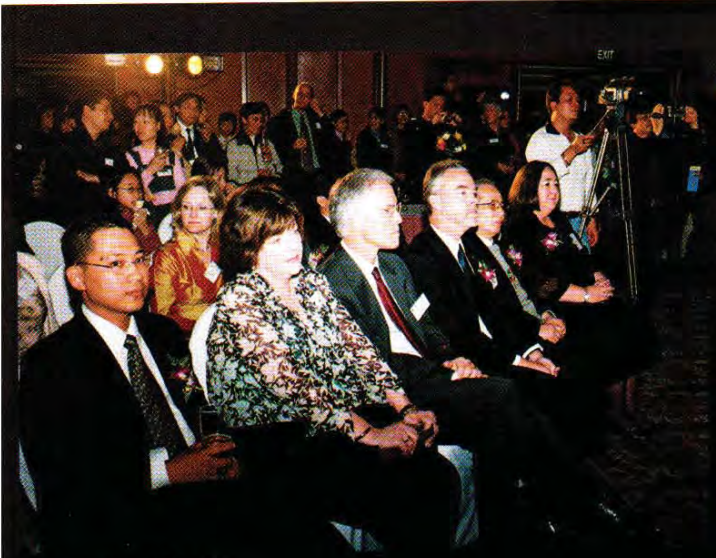
An interview about Hanoi Gala, 2005