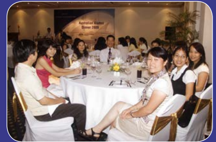
VGAC Danang Members