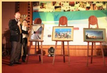
The Ambassador won an auctioned photo