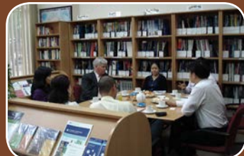
Meeting between the Australian General Consul, VGAC, and AEI HCMC