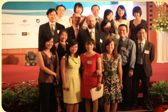
Warm talk and joyful faces in the Gala