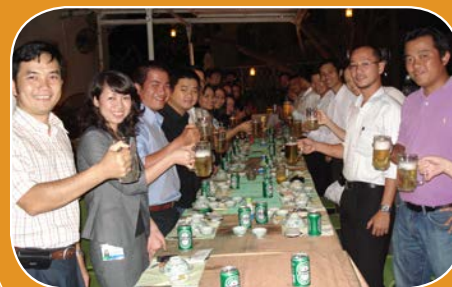
Let's cheer & wish VGAC a successful year