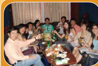
VGAC members at the gathering