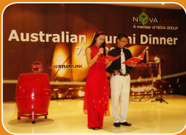
MCs of the Dinner