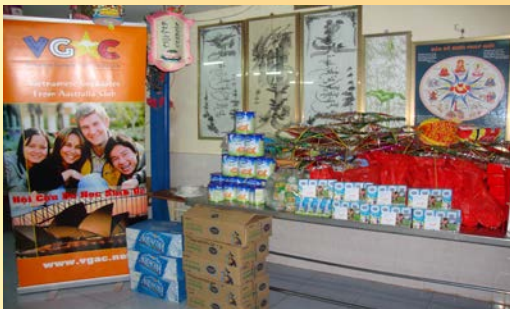
Donation of VGAC