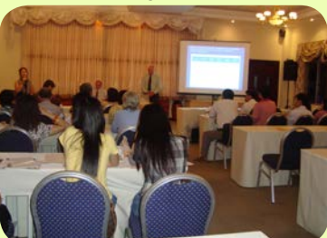
VGAC members at the seminar