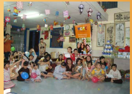
Waiting to play games