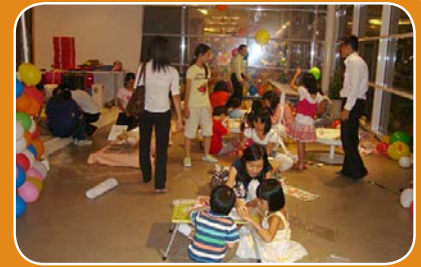
Children area at the Dinner