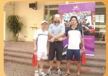
The Australian Ambassador and VGAC members