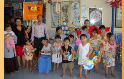
Kids with their friend