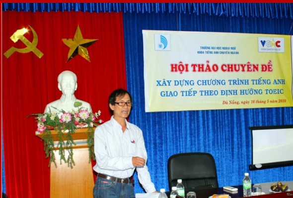
The Seminar entitled "Setting up a Syllabus for Teaching English Skills in orientation of TOEIC" cooperated by ESP Department, Danang College of Foreign Languages & VGAC-Danang Chapter on May 16th 2010.