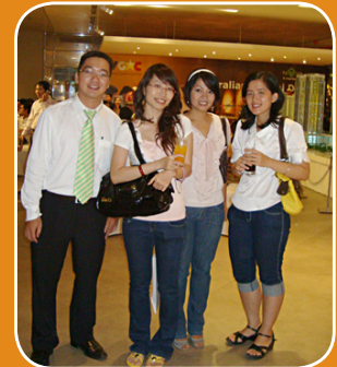
VGAC members at the Dinner