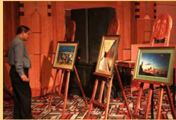
Photos of Australia are auctioned to raise money for children with cancer in K hospital