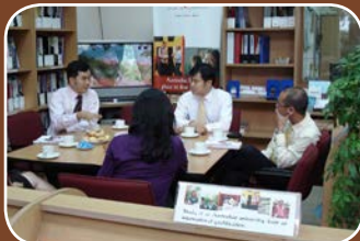
Meeting between VGAC and AEI HCMC