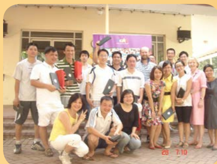
At the tennis tournament