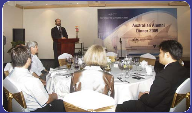
The Australian Ambassador's speech at the Dinner