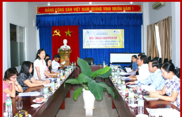
Discussion in the Seminar entitled "Setting up a Syllabus for Teaching English Skills in orientation of TOEIC" sponsored by Danang College of Foreign Languages & VGAC-Danang Chapter.

I was pleasantly surprised by the number of international students at Deakin. I considered this an asset, as I learned a great deal about other cultures, which is an education in itself.