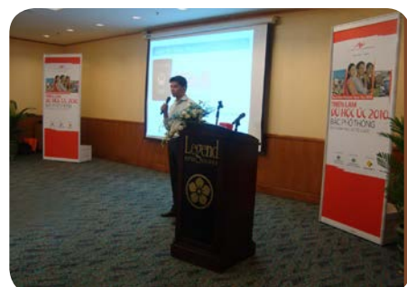
VGAC member and his presentation at the exhibition