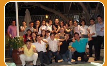
VGAC members -"Hello! "