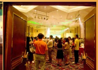
Warm talk and joyful faces in the Gala